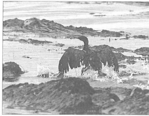
An oil-covered bird flaps its wings amid Refugio State Beach, north of Goleta, Calif.

Most analysts have forecast that the economy will expand at an annual pace of at least 3 percent in the current July-September quarter. For the full year, the economy is on track to grow 3 percent for the first time since 2015.